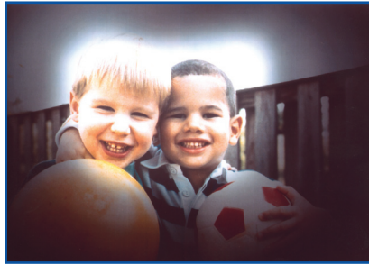
Vision with Glaucoma

January is Glaucoma Awareness Month. This is a great time to raise awareness in your community about this disease, which has no warning signs.